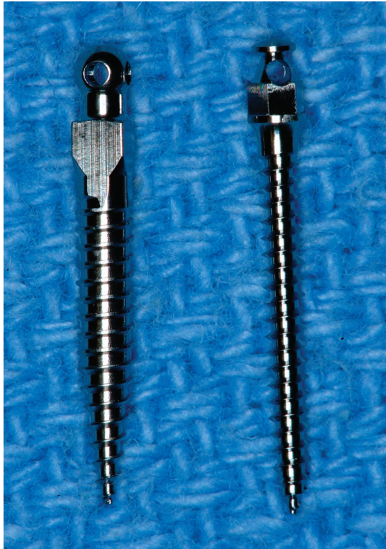
Figure 1. Two miniscrew implants with different configurations and sizes.

Periodontists should consult with their referring orthodontists to determine which to use because different loading appliances require different head configurations. All systems are made from either titanium or surgical-grade stainless steel and employ a conical or cylindrical screw design with asymmetric or symmetric thread pitch. Diameters range from 1.2 to 2.5 mm, and lengths range from 6 to 11 mm (Fig. 1). The principle variation is in the head shape, which is either a sphere with holes or a flat, slotted surface. Most of the systems on the market are self-tapping, although some of the more recently introduced ones are also self-drilling. Regardless of the design, the implant is usually placed after creating a pilot hole and can be immediately loaded with the orthodontic appliance. Case reports 2 and 3 illustrate surgical techniques.